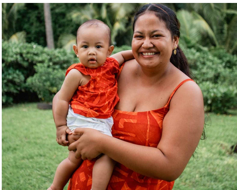
Aimata, a mother, attends a vaccine clinic in the Cook Islands with her son because she wants him to "have the best protection."

Draft communication strategies for the roll-out of new vaccines are now available in Cook Islands, Nauru, Niue, Samoa, Tokelau, Tonga, Tuvalu, and Vanuatu. These strategies will guide the governments' efforts to widely communicate the benefits of immunisation, mobilise caregivers of eligible children, and address vaccine hesitancy.