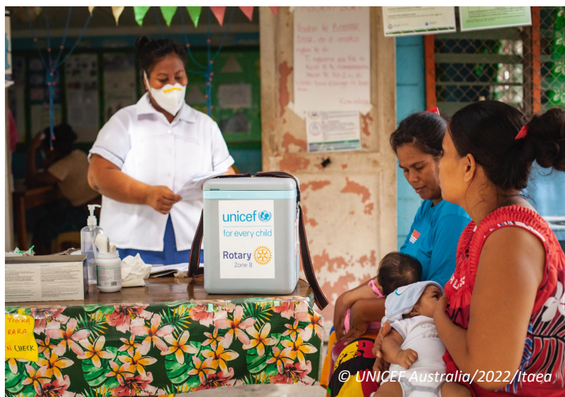
Above: Kiribati local public health staff deliver life-saving vaccines, provided by UNICEF and Rotary to little ones at risk of disease in South Tarawa